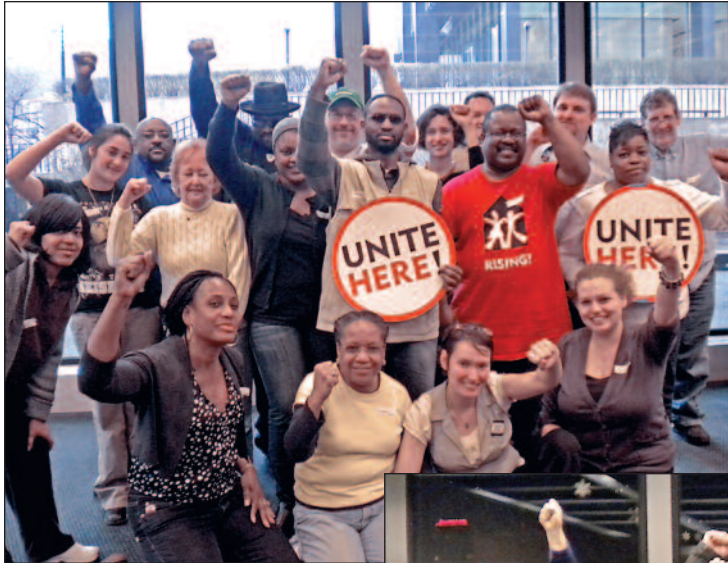
Local 57 Shop Stewards & Steward trainees celebrate the end of a successful training session

If you missed the first training but are interested in becoming a Shop Steward, join us for one of the upcoming all-day shop steward trainings on Tuesday May 10th, or Saturday May 14th. For more information talk to your committee leader or call 412-212-1142.